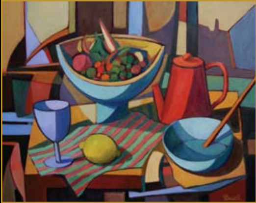
Ciotola blu Acrylic on board 40 x 50 cm