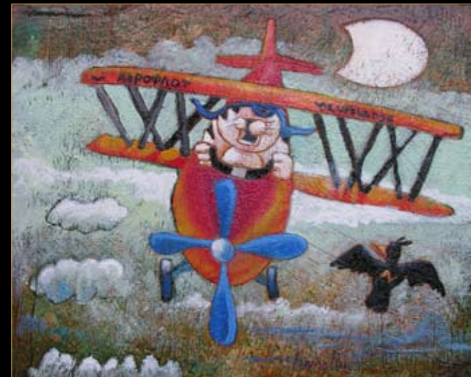
Aviatore Aviatore Oil fresco 40 x 50 cm