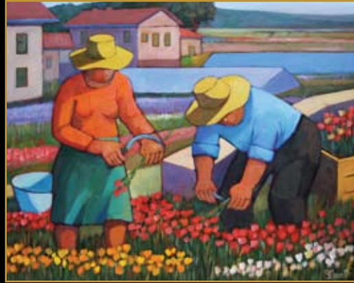
Raccolta di fiore Acrylic on board 40 x 50 cm