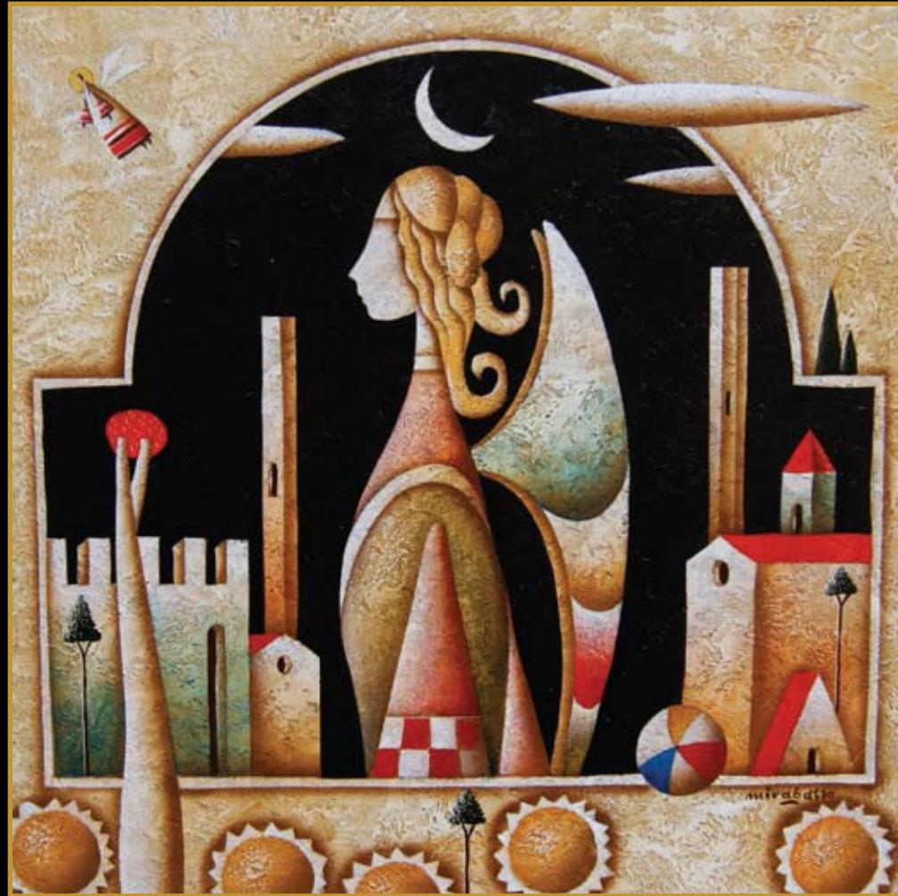
Angelo ne borgo Oil on board 30 x 30 cm