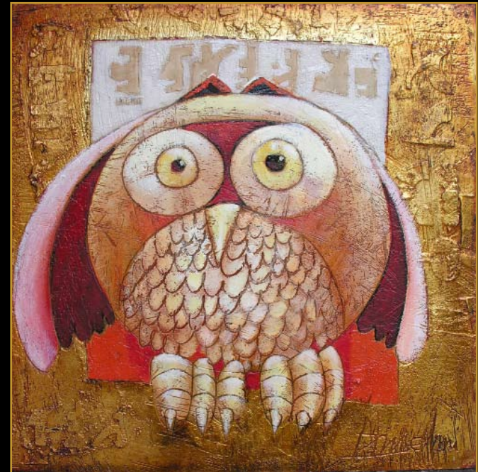
Mistero Mistero Oil fresco 50 x 50 cm