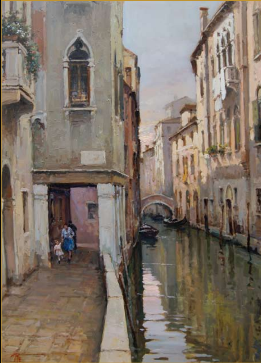
Eros Rumor Canale S. Giacomo dell'Orio Oil on canvas 70 x 50 cm