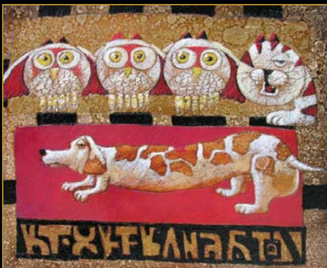
Amante dei cani Oil fresco 40 x 50 cm