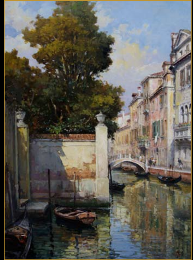
Eros Rumor Rio degli Ormesini Oil on canvas 70 x 50 cm