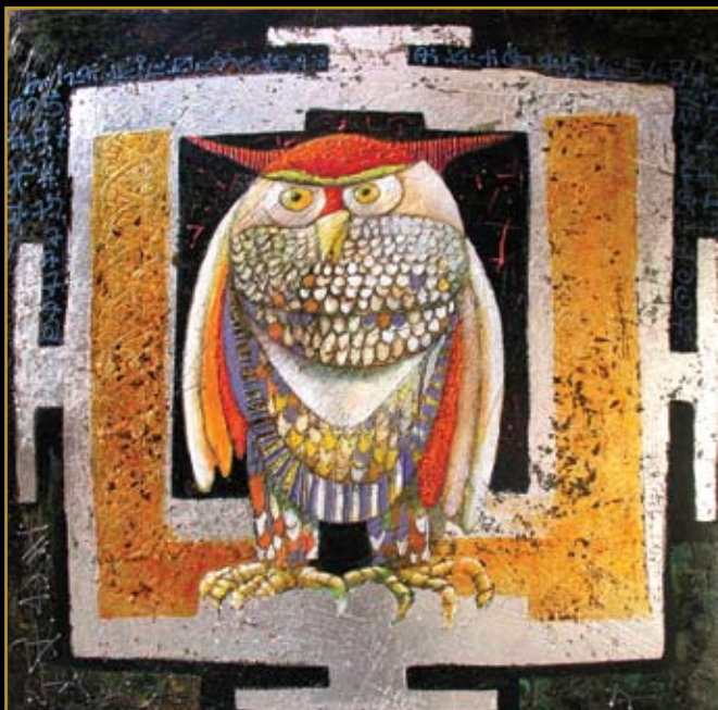
Gufo D'oro Oil fresco 100 x 100 cm