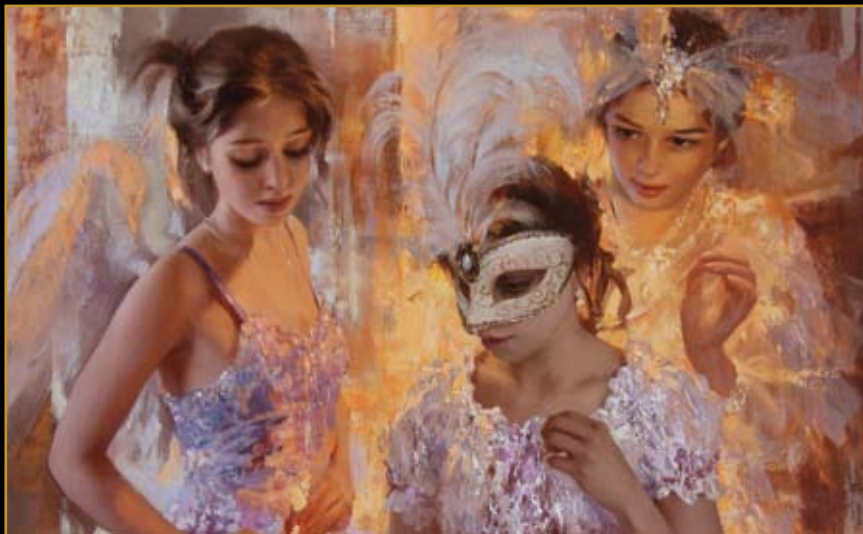
Eugenea Carnevale Oil on canvas 88 x 66 cm (Detail)