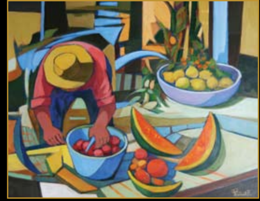
Contadino Acrylic on board 40 x 50 cm