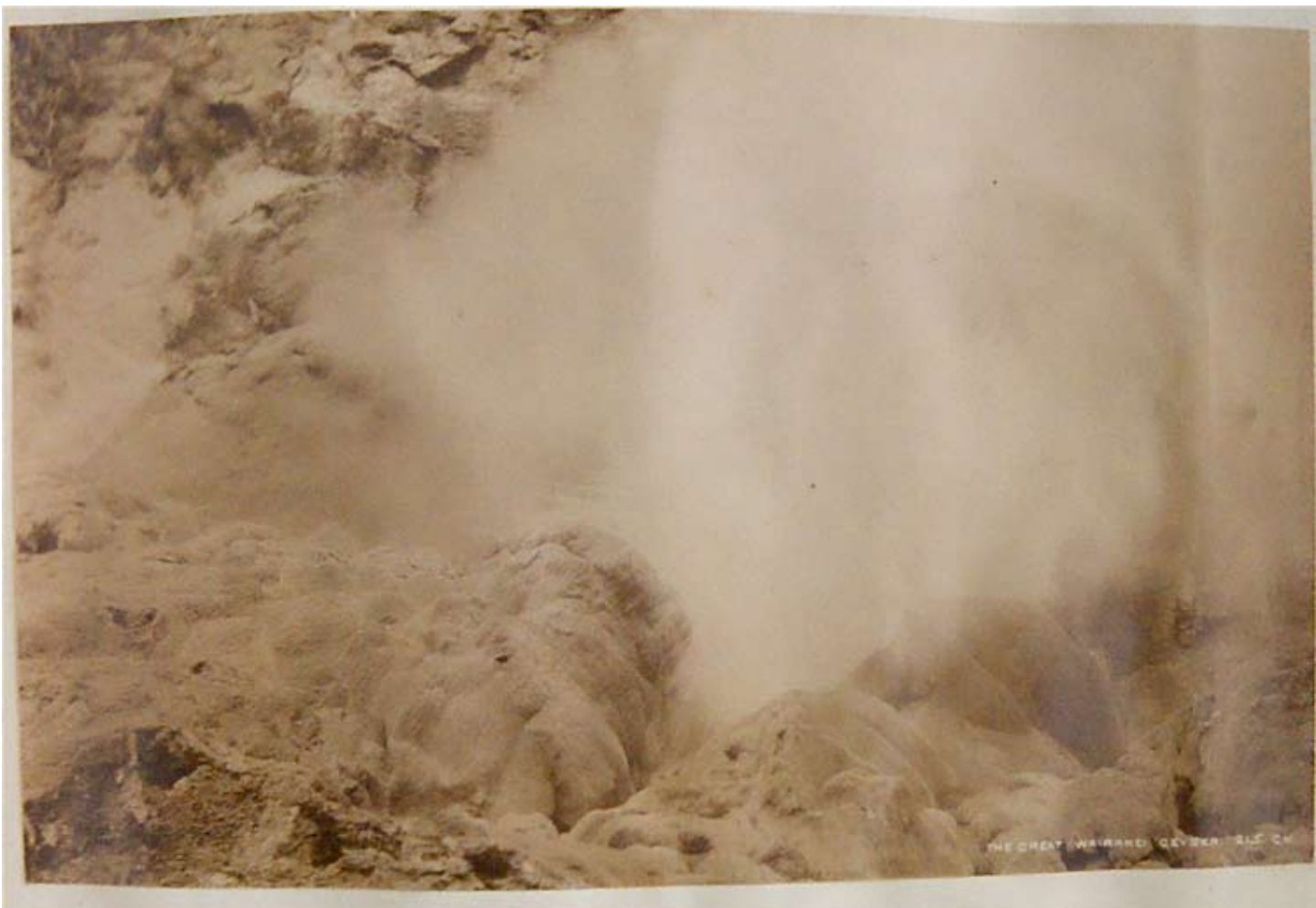
THE GREAT WAIRARAPA GEYSERS N.Z.