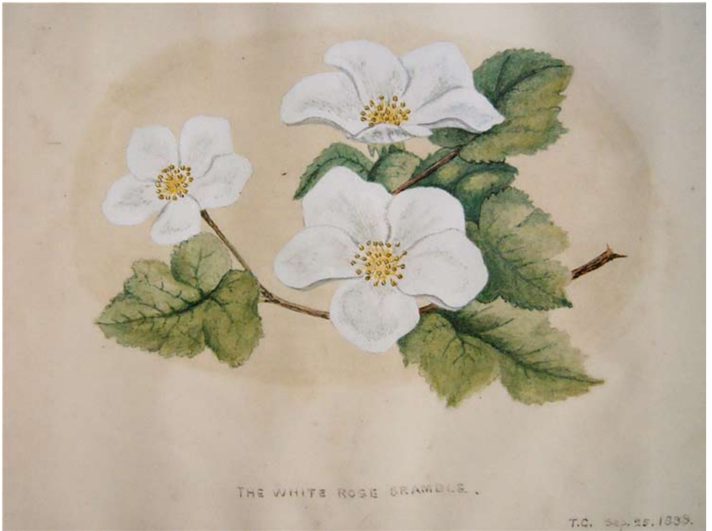
THE WHITE ROSE BRAMBLE .