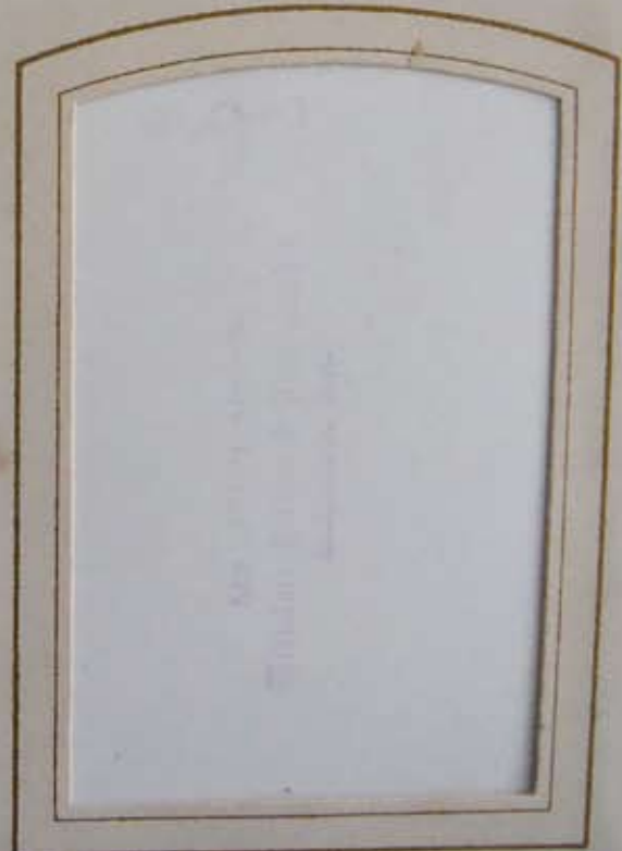
W T M Snow