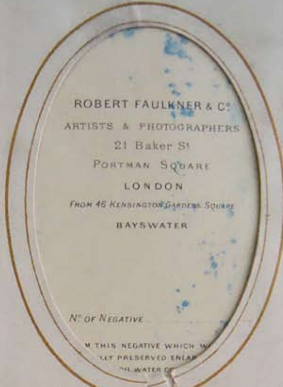
W. Snow died 1875