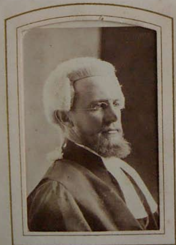
Tustice Way. Do