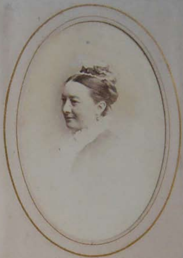
R. M. S.