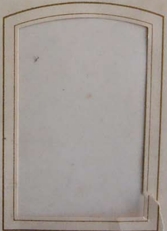
Eliya S Snow