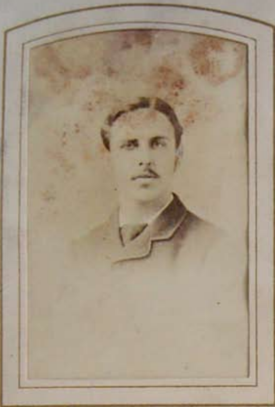
S. C. S.