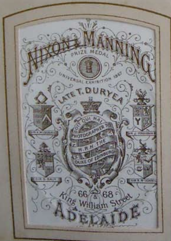
Wm Wm Snow. Isabel.