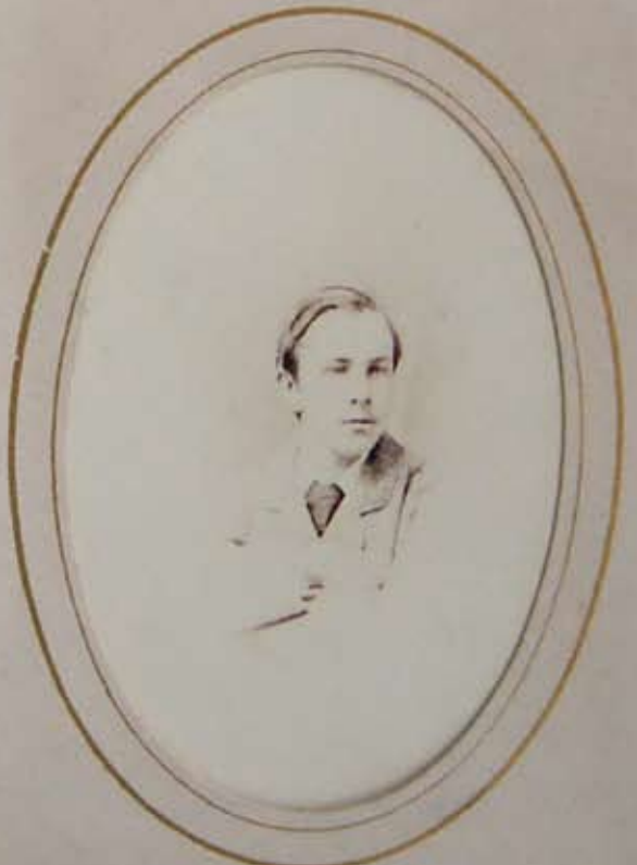
W T M S