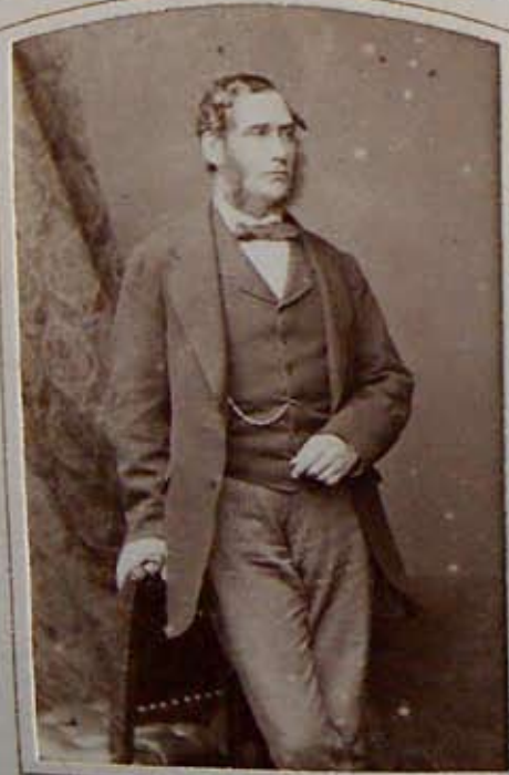
T. M. S.