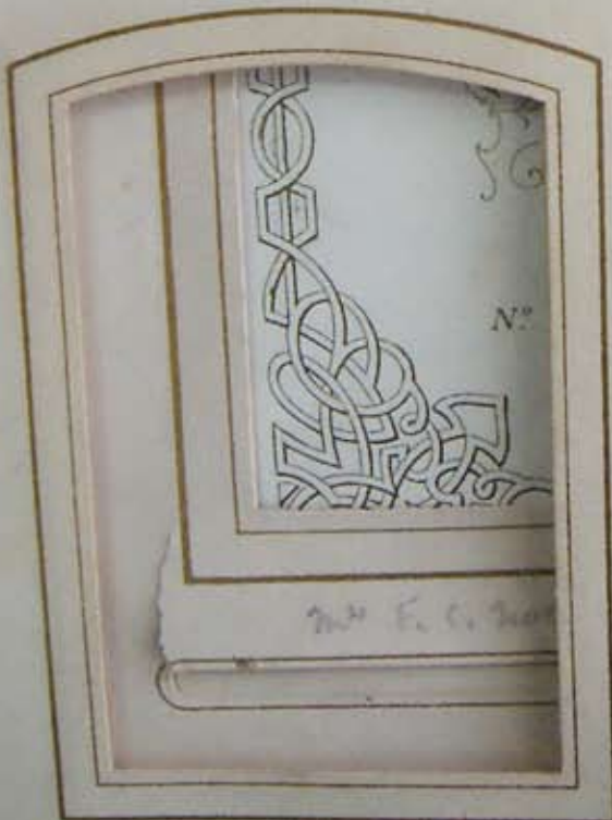
Nº F. G. 200