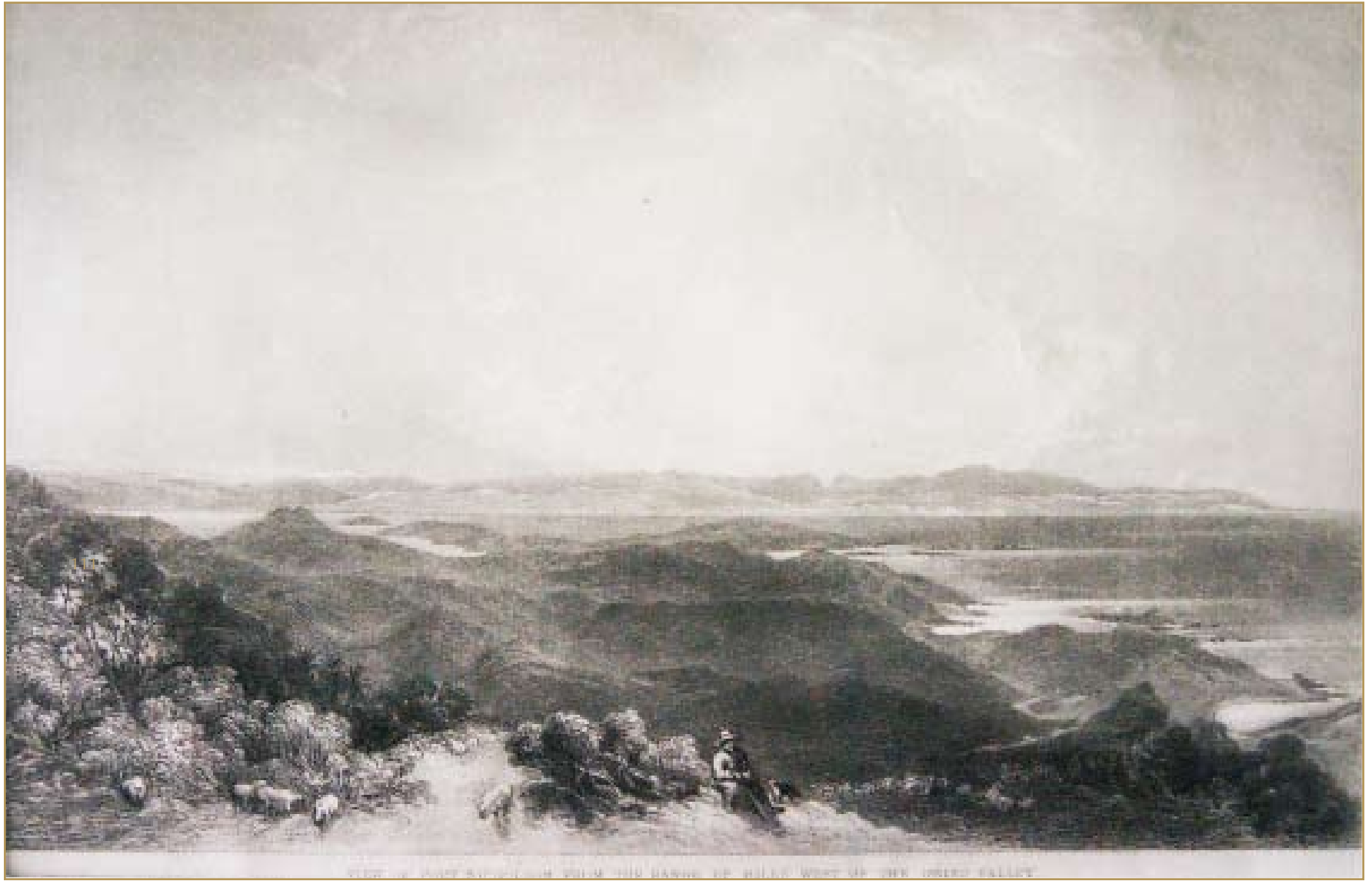
VIEW OF EAST SLOPE OF MOUNT HILL FROM WEST OF THE LOWER FALLS