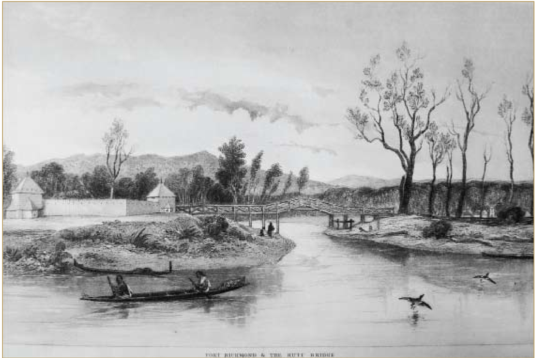
FORT RICHMOND & THE RUFF BRIDGE.