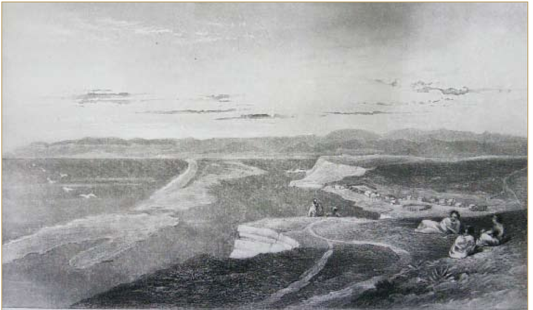
PALLISER BAY & THE SAND BAR OF THE WAIRARAPA