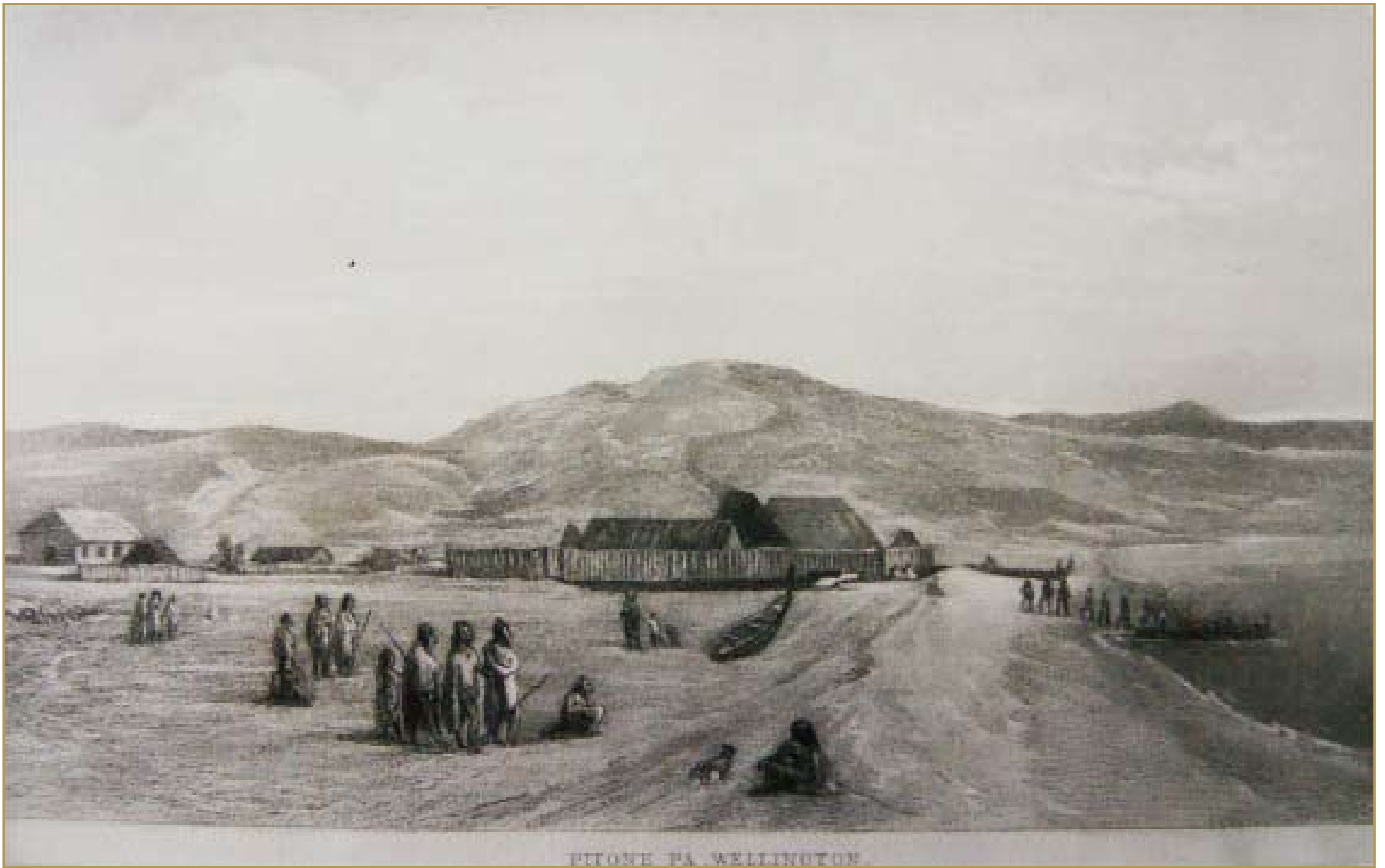
PITONE PA WELLINGTON