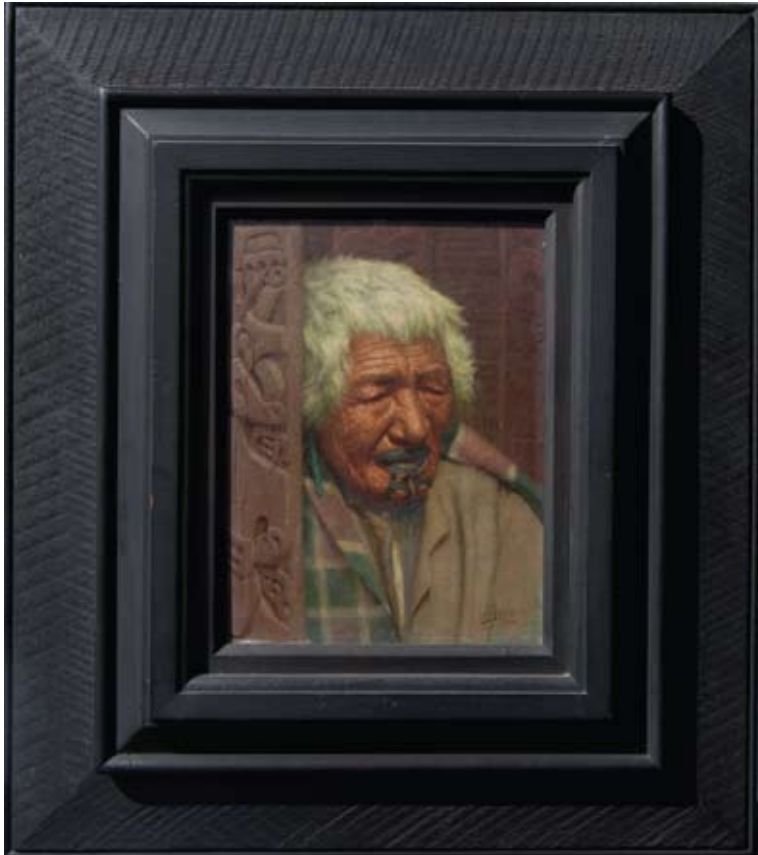
Lot 52 in original C F Goldie frame