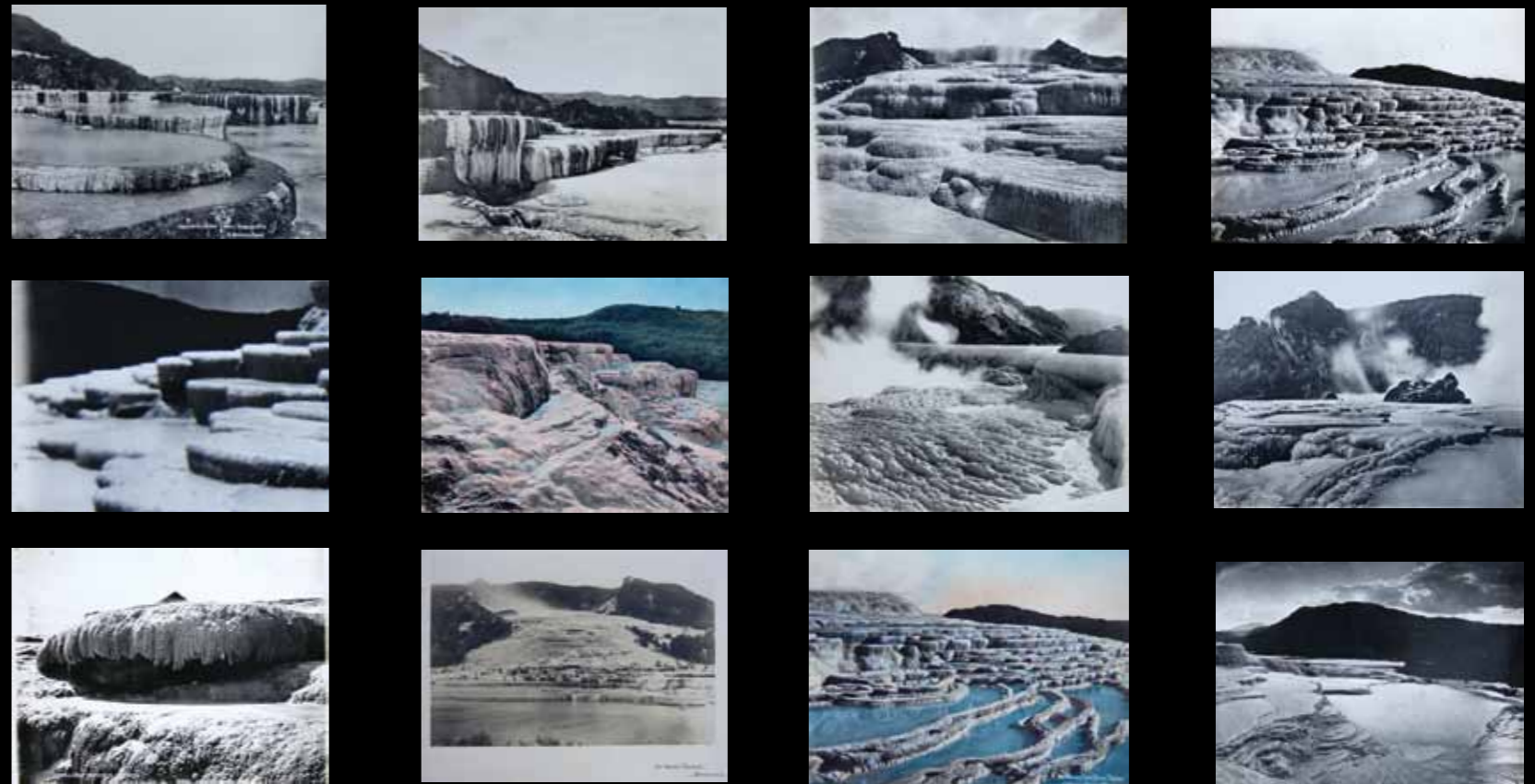
Twelve photographs by Charles Spencer and others featuring view of Lake Rotomahana, Otukapuarangi The Pink Terrace & Te Tarata The White Terrace