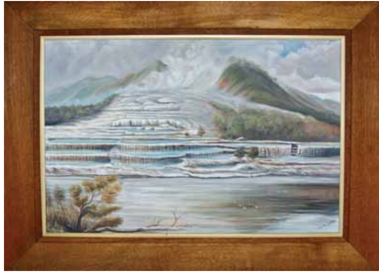
Ina Haszard oil painting