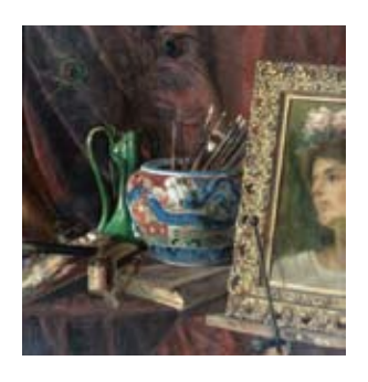
45 CHARLES FREDERICK GOLDIE

1870 - 1947 Study of Still Life c. 1890 Oil on canvas 89.0 x 73.0 Inscribed 'For competition, Class B, Section 7, Study of Still Life (in oil) by Karaka' in artist's hand on original label affixed to canvas verso