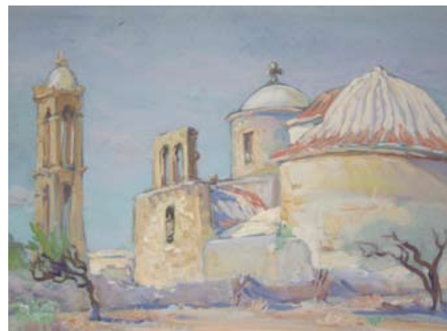
North African Monastery