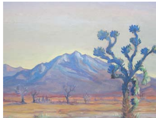
Cactus Hill and Sunset