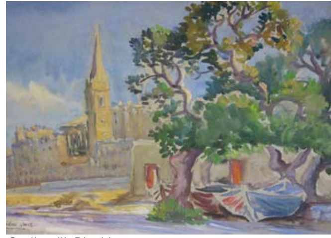
Castle with Dinghies