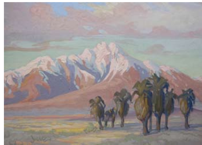
Mountain Range South Island