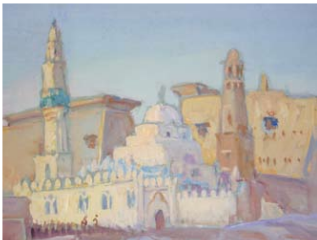
North African Monastery