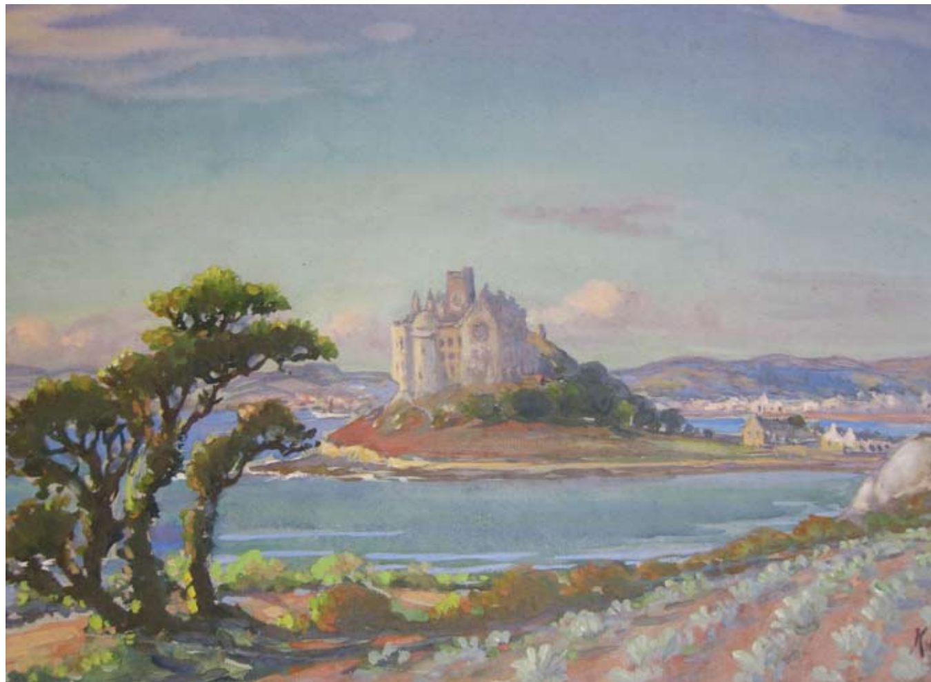
St Michaels Mount from Bracali fields