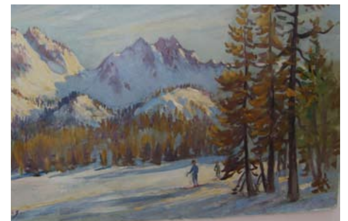
Lake St Anthony