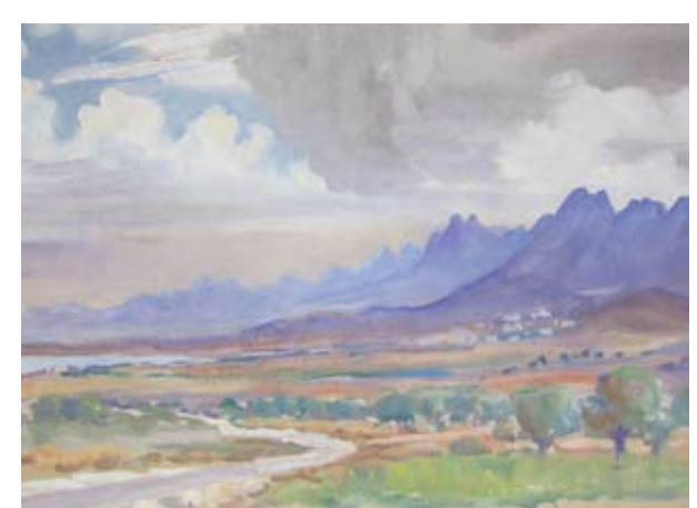
South Island Scene