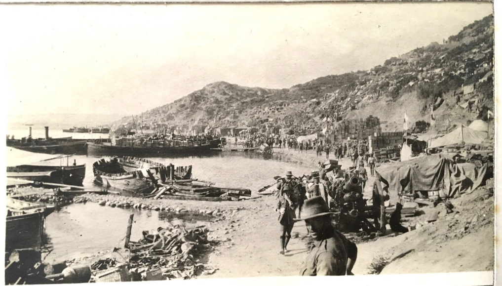
"ANZAC" OR "Z" BEACH. 1915.