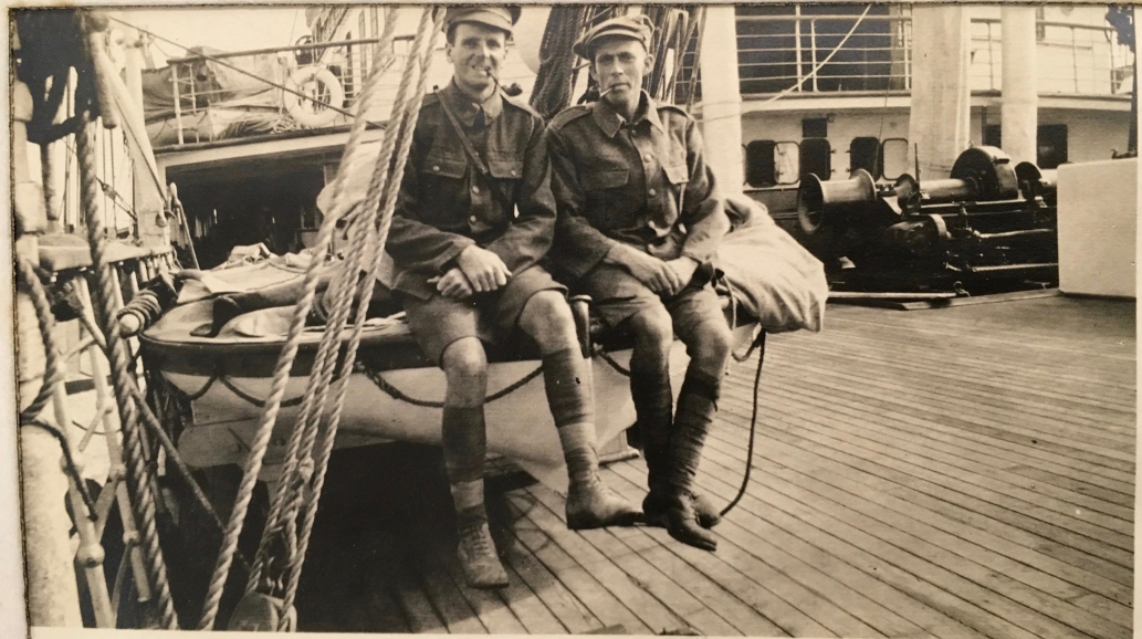
"FRANCONIA" - ENGLISH CHANNEL.