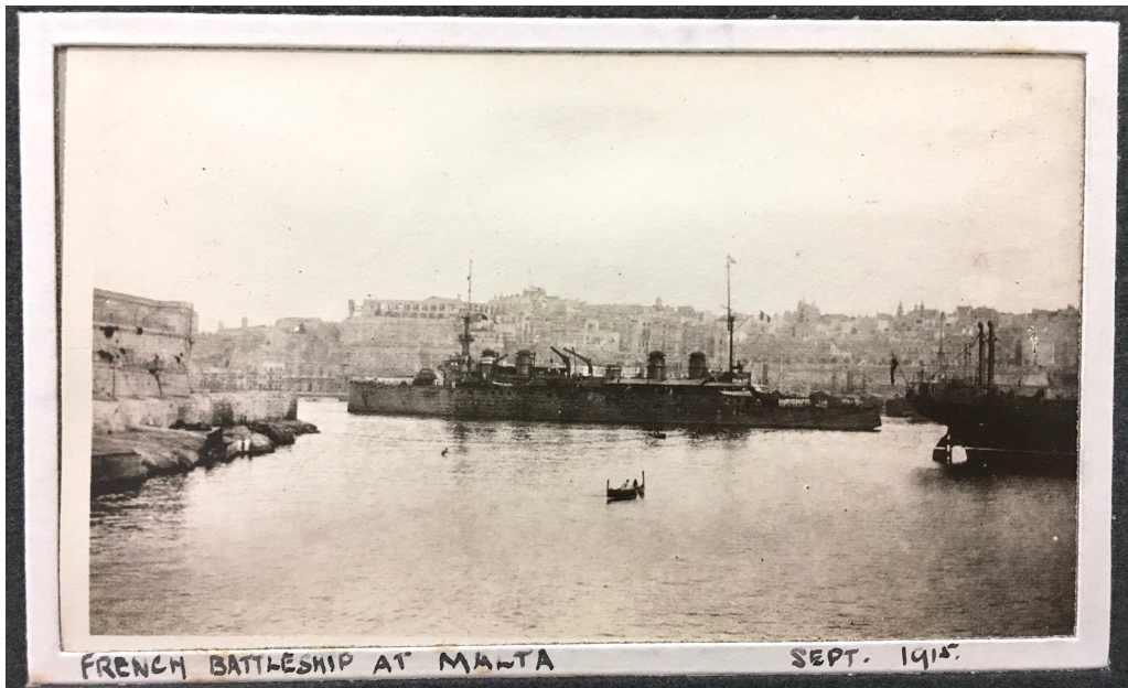
FRENCH BATTLESHIP AT MALTA