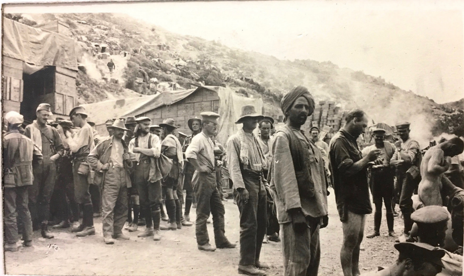
SCENE ON BEACH.