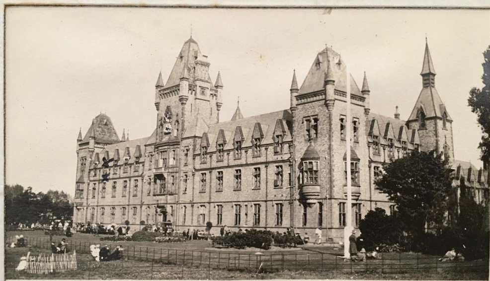
3 RD LONDON GENERAL HOSPITAL. WANDSWORTH. S.W.