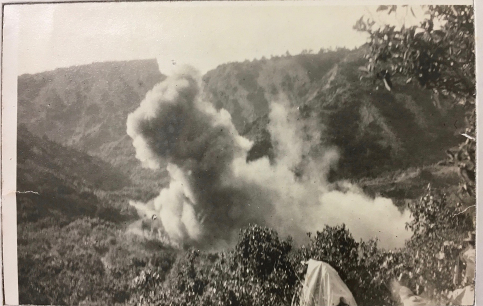
KIND ATTENTION FROM THE "GOELEN" IN THE NARROWS. MAY 1915.