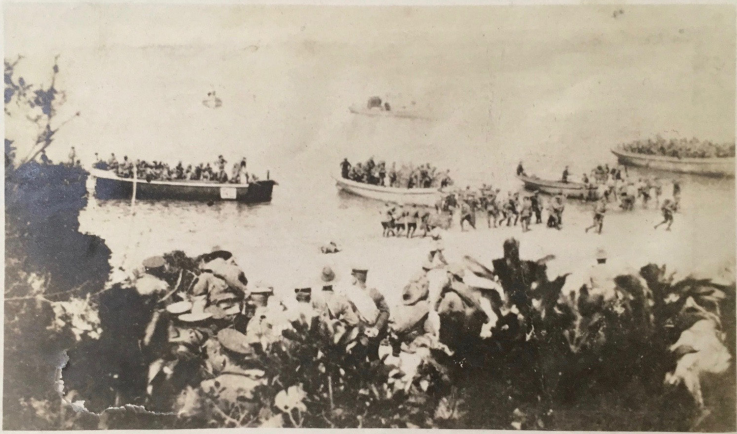
The first Anzac landing & the first Australian to be killed on the beach.