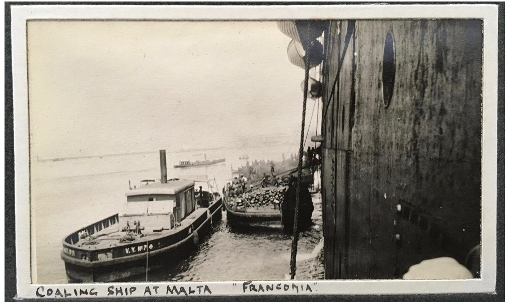
COALING SHIP AT MALTA "FRANCONIA"