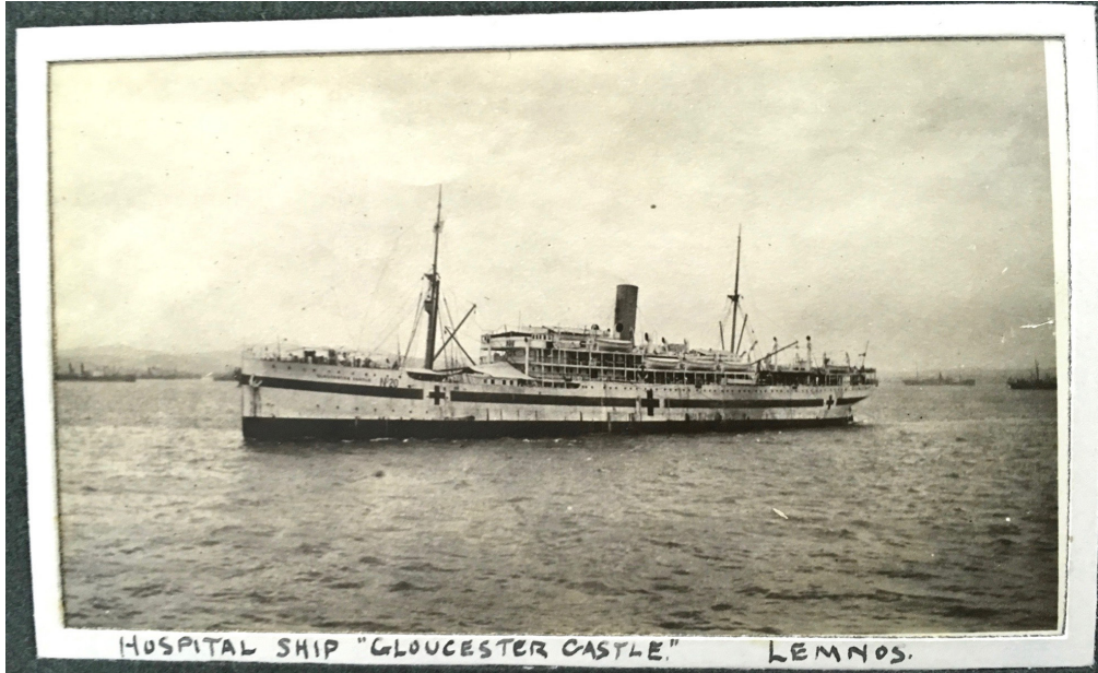
HOSPITAL SHIP "GLOUCESTER CASTLE." LEMNOS.