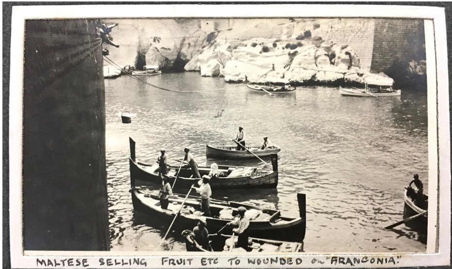
MALTESE SELLING FRUIT ETC TO WOUNDED ON "FRANCONIA"