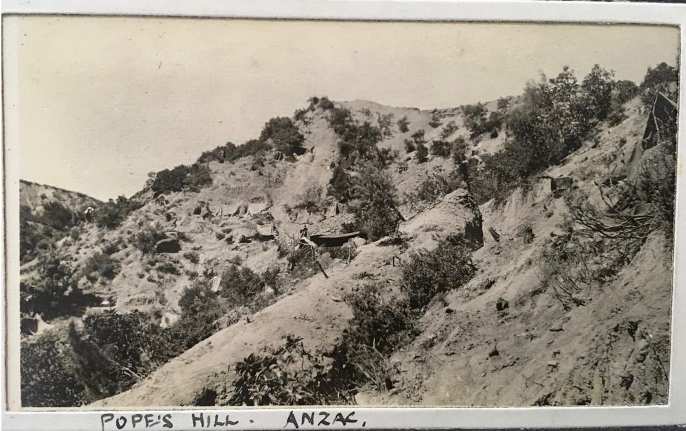
POPE'S HILL - ANZAC,

Sent to an Australia brother, as it had her son's grave shown in it.