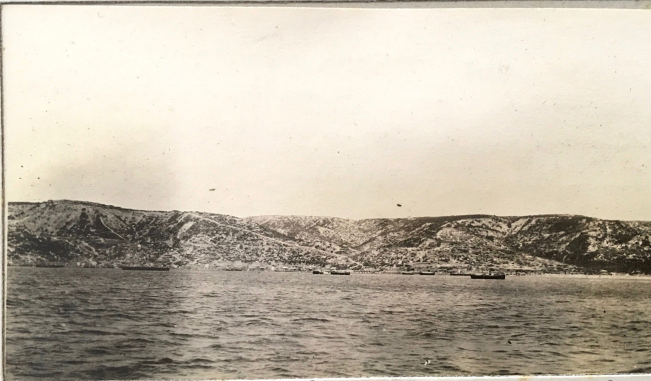
ANZAC FROM THE SEA.