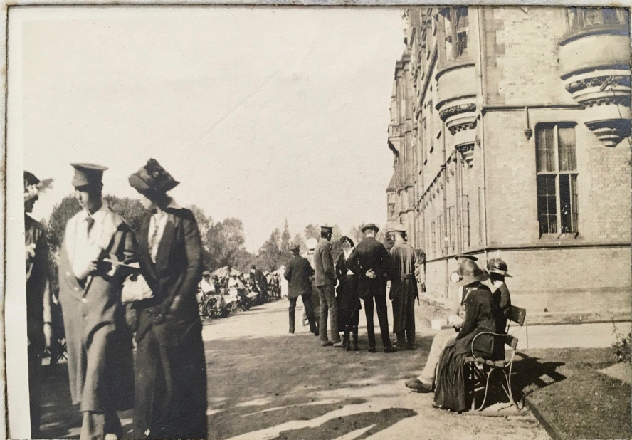
VISITING DAY AT WANDSWORTH.