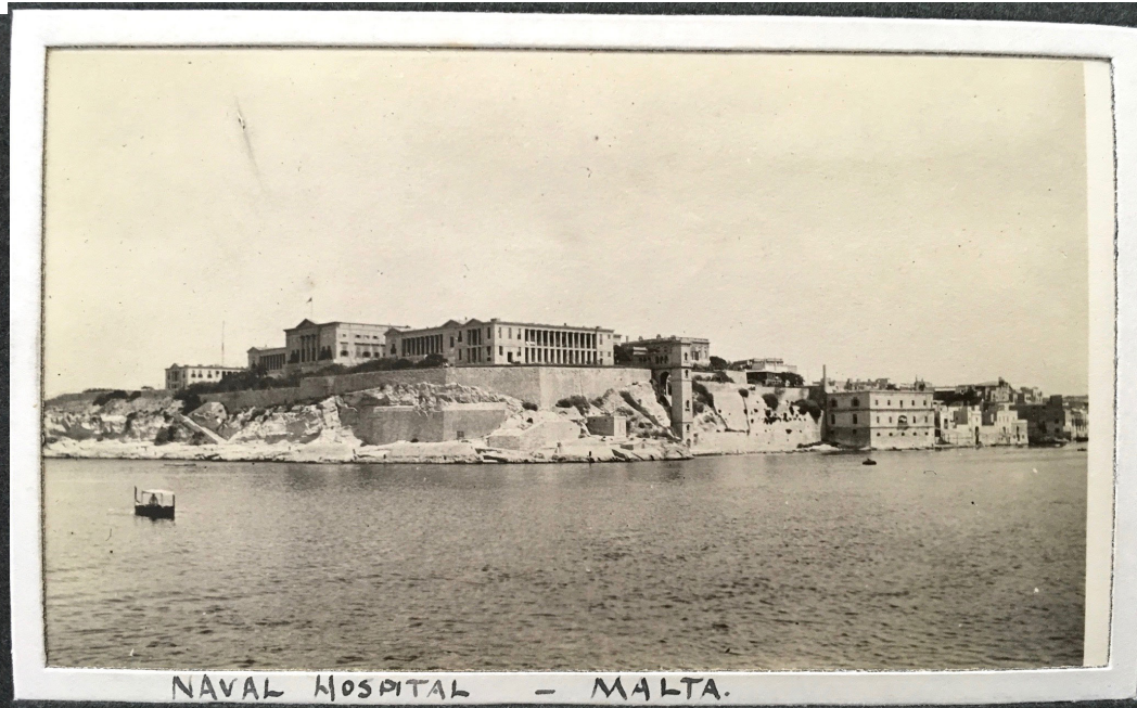
NAVAL HOSPITAL - MALTA.