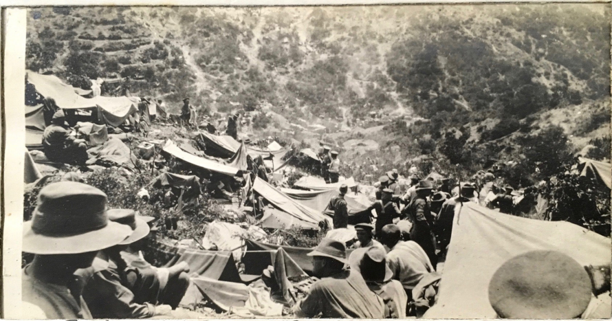
3 rd LIGHT HORSE IN "BIVVIES" OR DUG-OUTS.