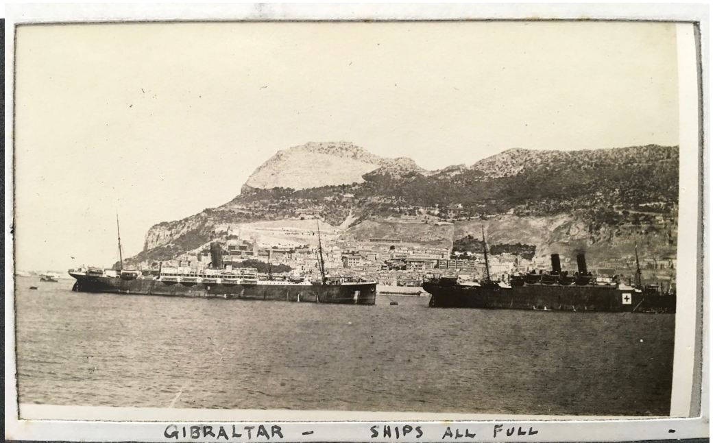
GIBRALTAR - SHIPS ALL FULL