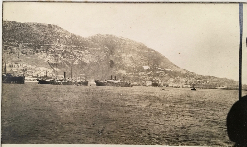
OF WOUNDED FROM DARDENELLES.