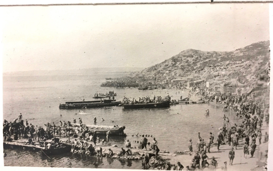
ANZAC COVE. BOYS IN SWIMMING.