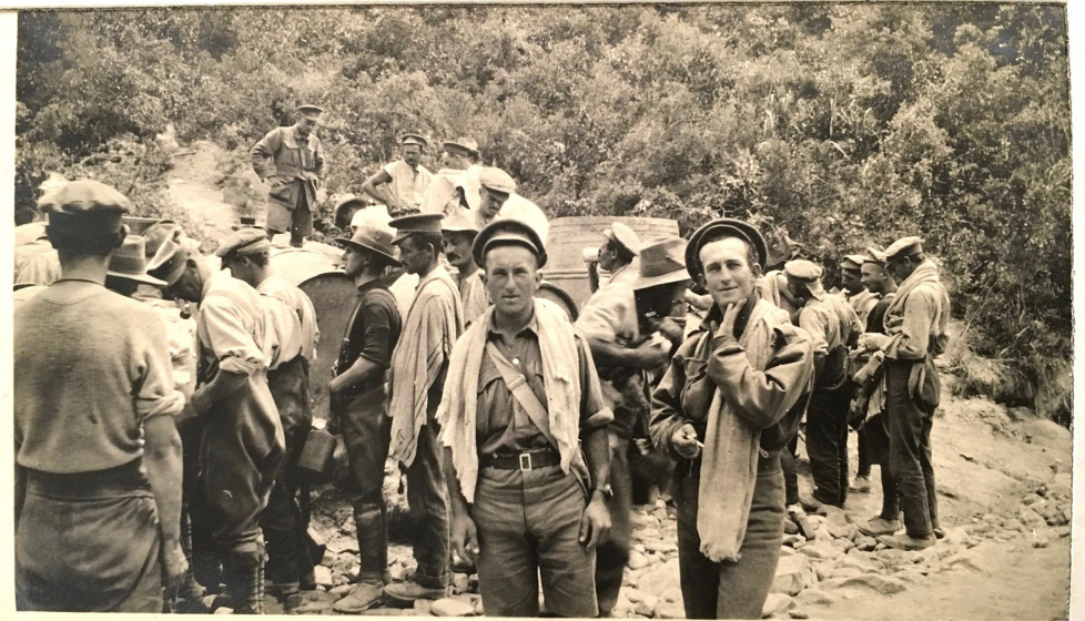
WATER WELL. SHRAPNEL VALLEY. ANZAC.