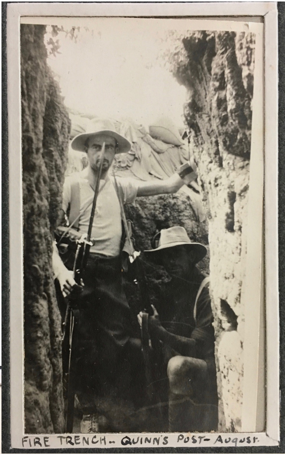
FIRE TRENCH - QUINN'S POST - AUGUST.