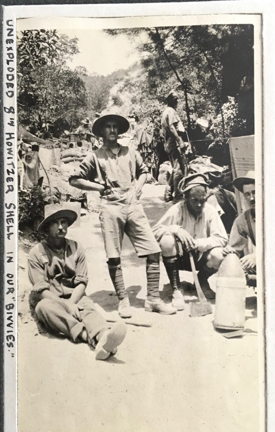
UNEXPLODED 8" HOWITZER SHELL IN OUR "BIVVIES."