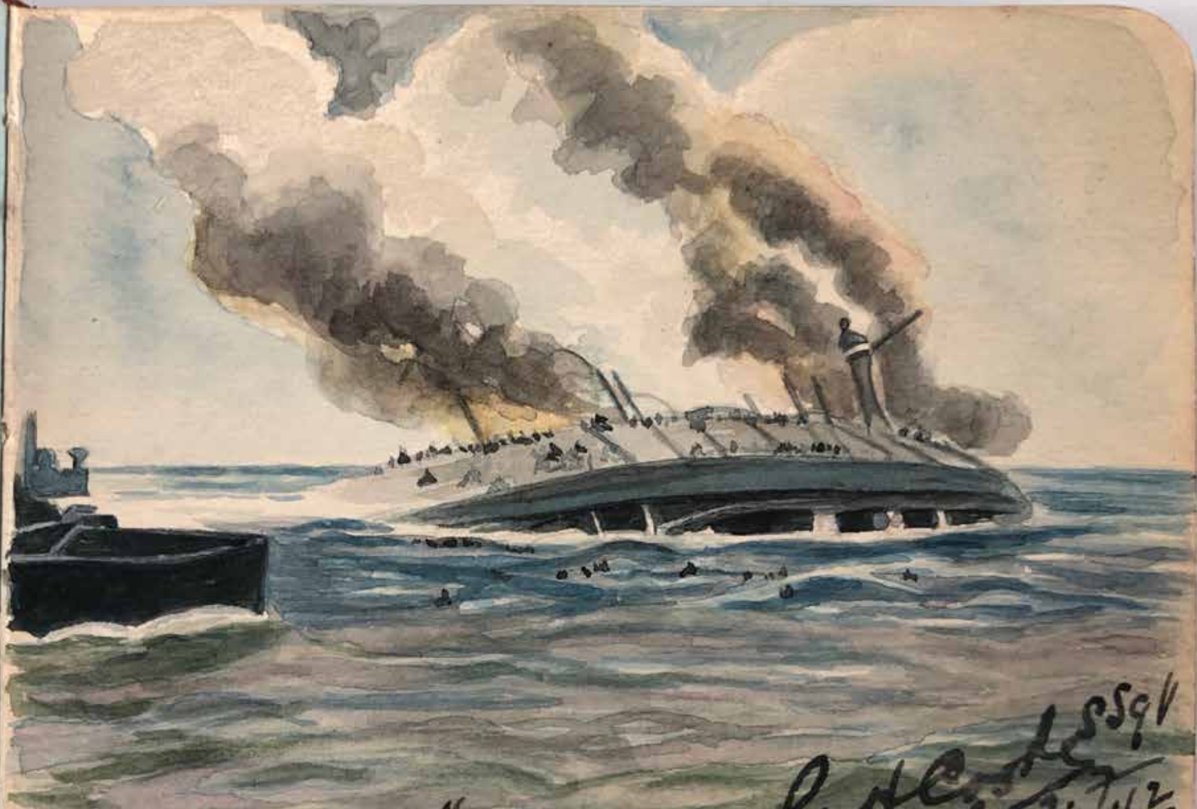
The Sinking of the "Bluecher" 25 Jan 1816

G. H. C. H. S. S. V. ran to 3. Mach 16 2 / 16